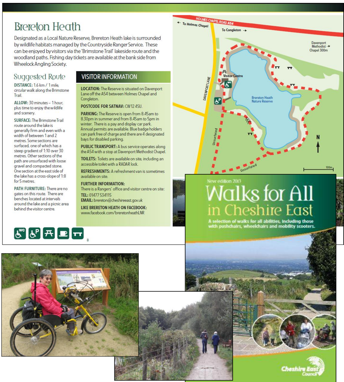
Extracts from the Walks for All leaflet and people on accessible routes in the new leaflet

The information has been collated into a standard format and checked by the volunteers of the Forum. The new leaflet, More Walks for All , is in design and is proposed to be published in spring 2015.