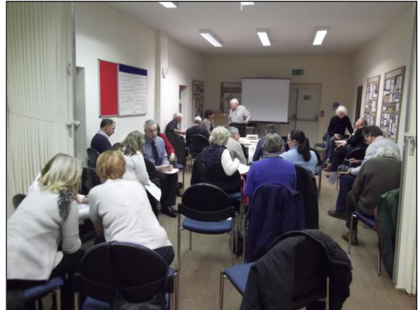
Rural road safety meeting discussion