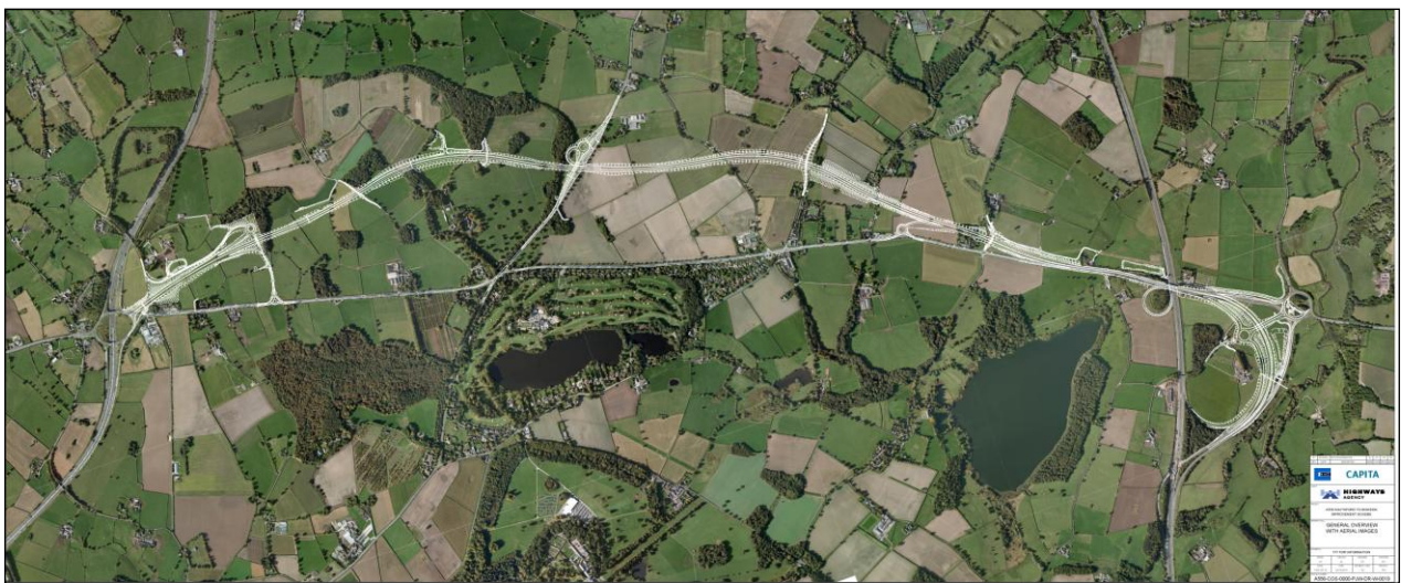
Highways Agency A556 Knutsford to Bowdon public consultation document: Aerial View with Route